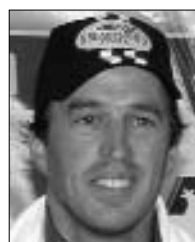
Formula Atlantic Mirl Swan Platte City, Mo. Swift