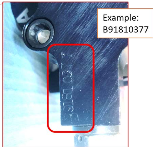
Fig.3: Serial # View

This document is confidential and is supplied on express condition that it shall not be lent, copied, or disclosed to any other person, or used for any other purpose without the written consent of Honda Performance Development.