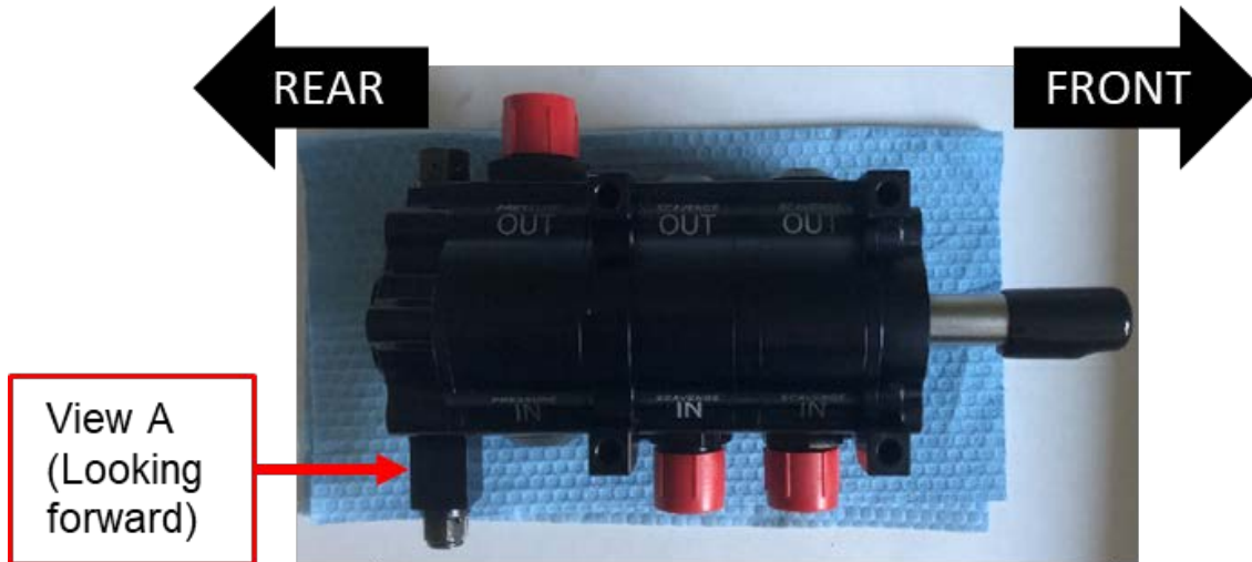
Fig.1 Pump Side View