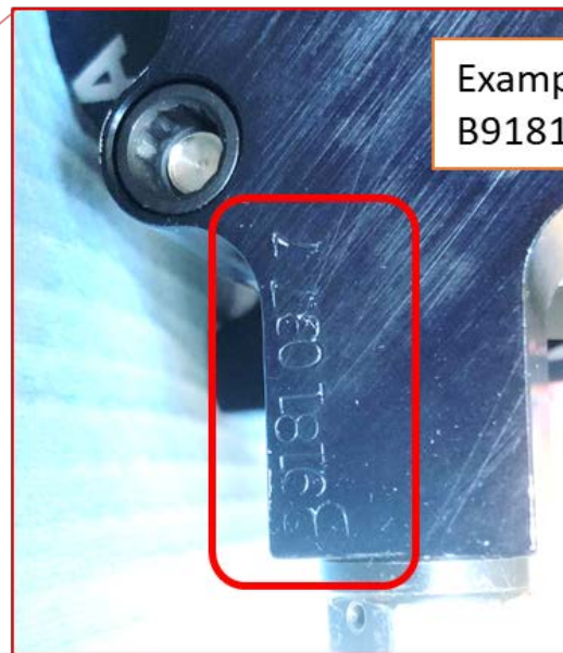
Fig.3: Serial # View

This document is confidential and is supplied on express condition that it shall not be lent, copied, or disclosed to any other person, or used for any other purpose without the written consent of Honda Performance Development.