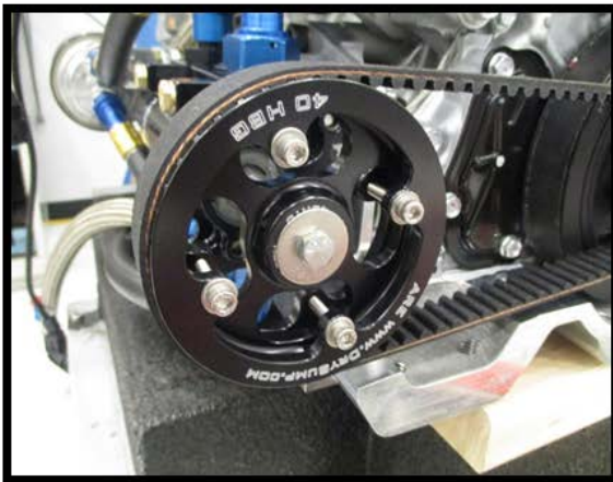
Fig. 6: Pulley