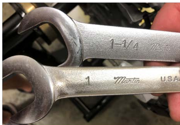
Fig. 5: Suggested wrenches for tight clearance (McMaster-Carr)

This document is confidential and is supplied on express condition that it shall not be lent, copied, or disclosed to any other person, or used for any other purpose without the written consent of Honda Performance Development.