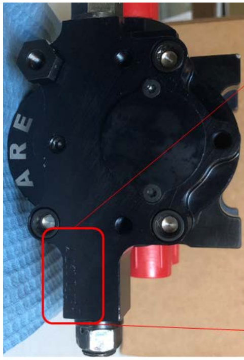
Fig.2: View A